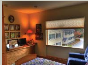
Merten's House Woodstock, Vermont

Two story addition to contain 12 new residential units and administrative space totaling 9,500 sf. Also reconfiguration to the existing commercial kitchen and an addition to the dining room totaling 800sf.