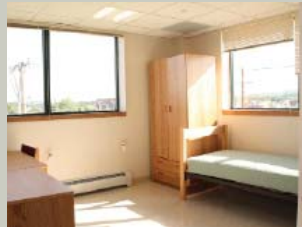
West River Valley Assisted Living Townshend, Vermont

St. Paul's School Interviewer- ASP 2005-present